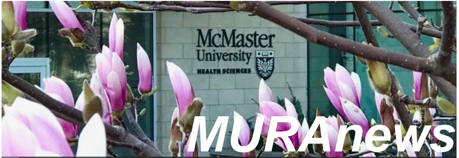
Magnolias in bloom, McMaster Health Sciences Library