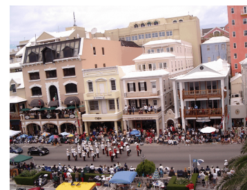
Bermuda Day Parade