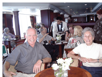
Above: the Newcombes relishing their time together