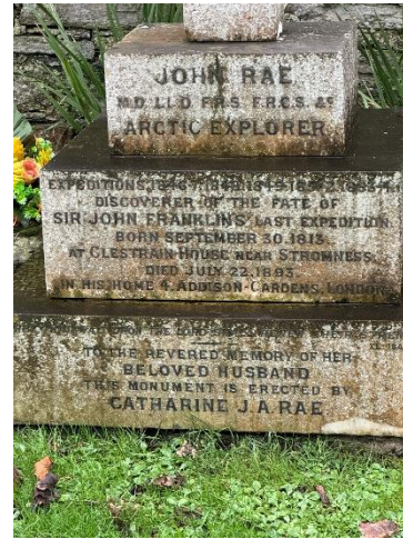
Base of John Rae's gravestone, Kirkwall

On Orkney, Rae is still a hero, and his tombstone in the Kirkwall churchyard refers to him as the "discoverer of the fate of the Franklin expedition." In fact, John Rae followed us around our tours of Orkney: we visited his house, saw his grave in Kirkwall, and came across a statue of him in the other large town, Stromness. But our most surprising encounter was on a tour of the Highland Park distillery: they had just produced a 17-year-old single-malt whiskey named in his honour. And so, inevitably, John Rae accompanied us home.