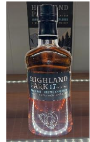
Highland Park's tribute to John Rae