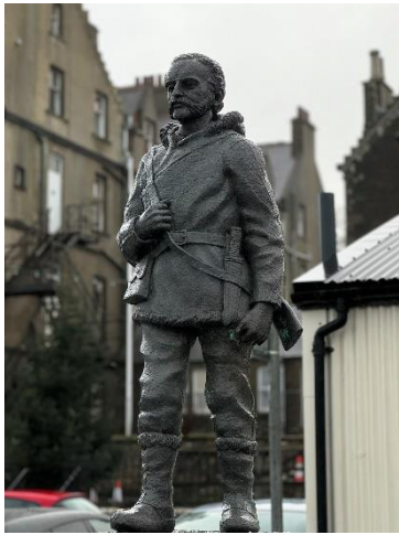
Statue of John Rae, Stromness