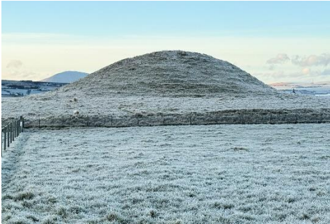
Maes Howe passage tomb