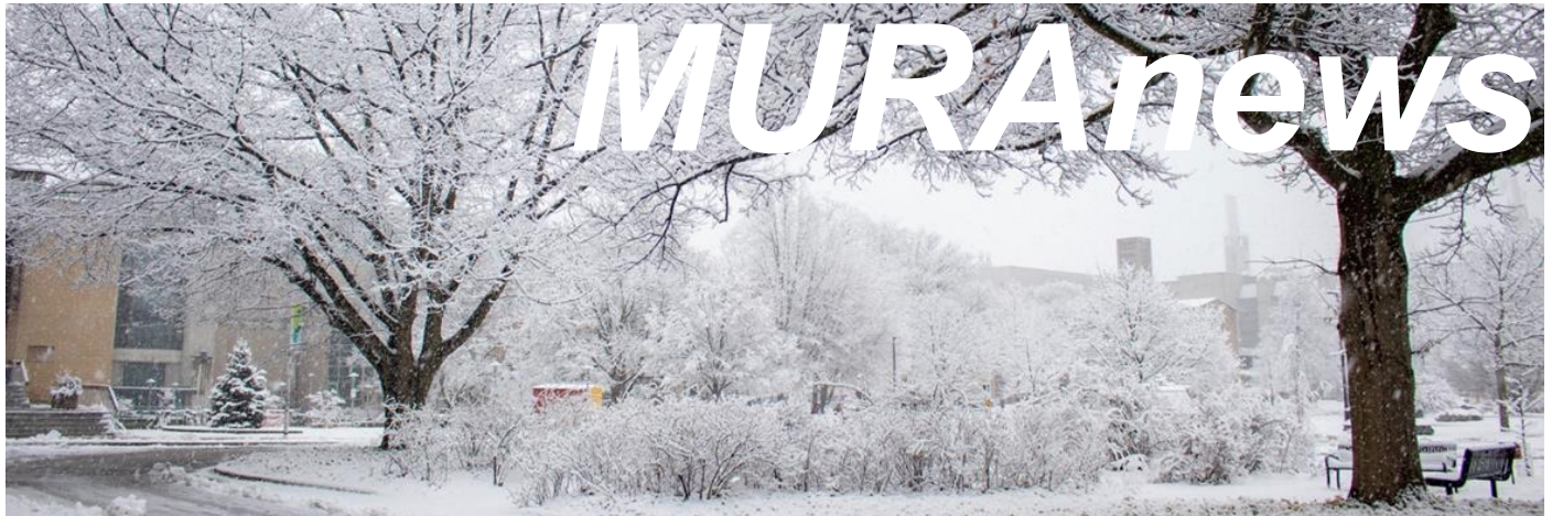
Nina de Villiers Garden, central campus