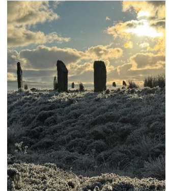
Ring of Brodgar henge monument