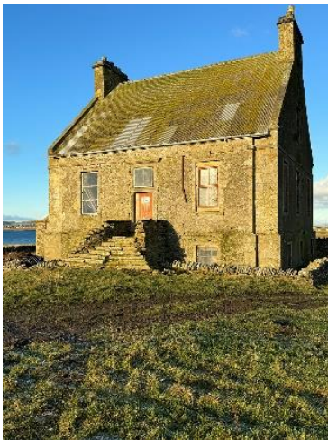
John Rae's house

standing stone monuments and burial cairns. They were all eerily beautiful in the frosty winter sunlight.