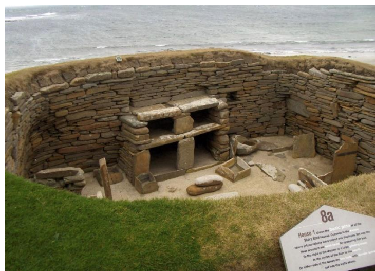
House 1 at Skara Brae

One place that looms large in the history of our kind of archaeology is - perhaps surprisingly - the Orkney Islands, off the north coast of Scotland. There are several sites there that were investigated in the early 20th century by one of our notable predecessors, V. Gordon Childe. Among other claims to fame, he coined the